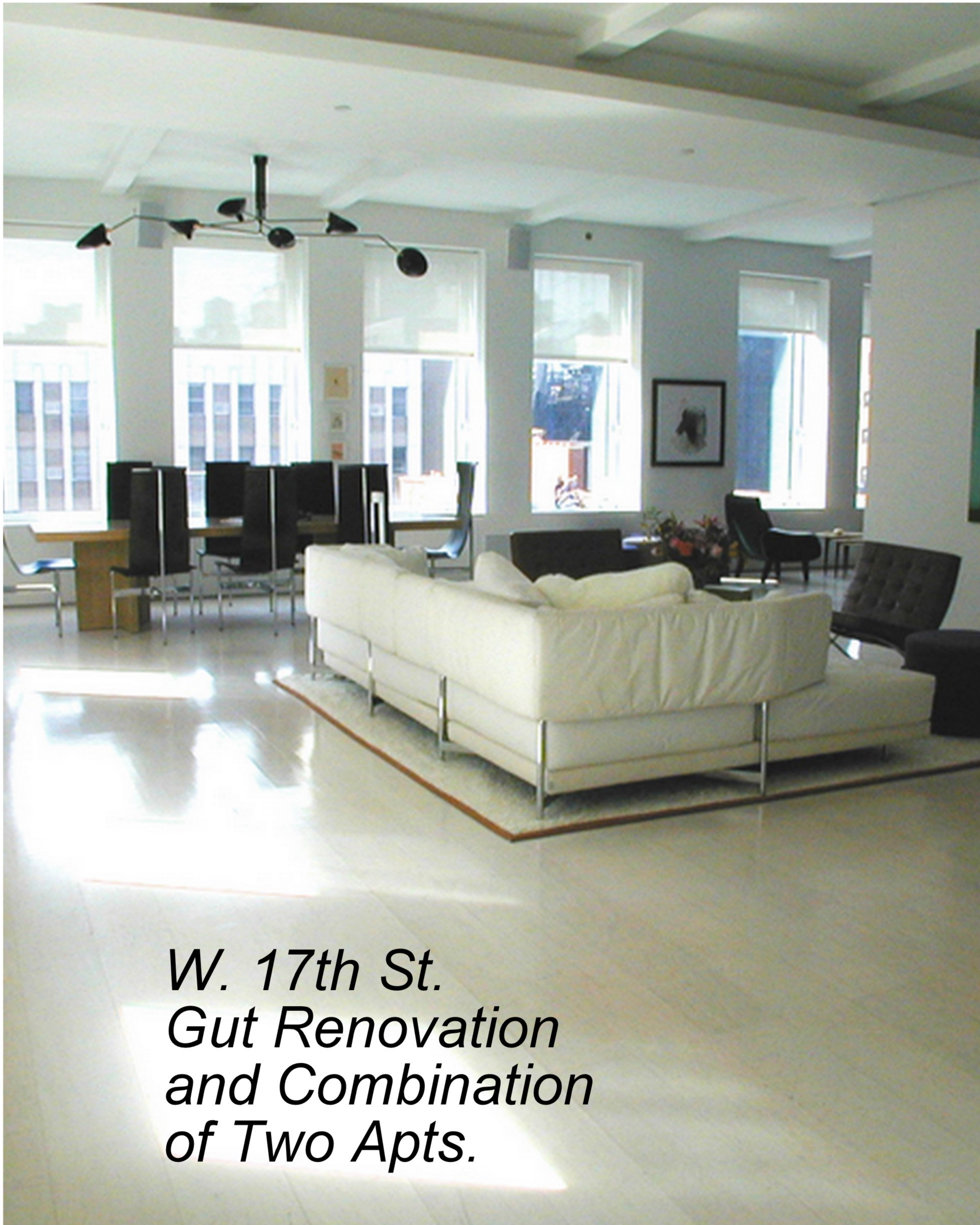
W. 17th St. Gut Renovation and Combination of Two Apts.